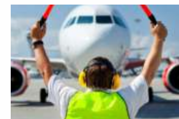
Aviation & Ground Handling