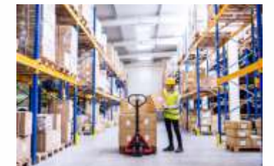
Logistics & Warehousing