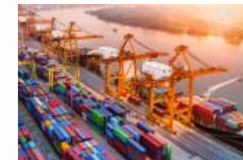
Ports & Cargo