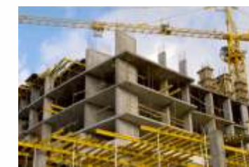
Construction & MEP