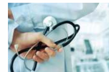
Medical & Healthcare