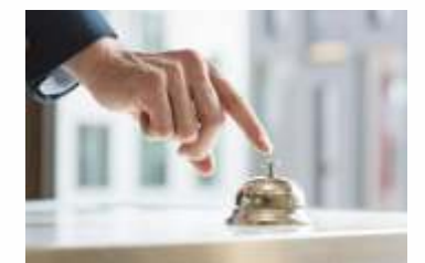
Hospitality & Catering