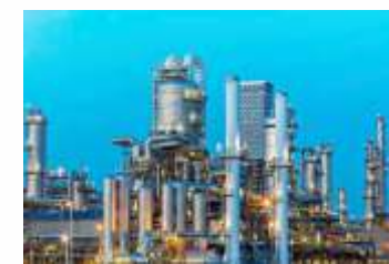
Oil & Energy

We provide highly skilled, semi-skilled, & unskilled manpower from INDIA to EUROPE, UK, GULF COUNTRIES and more