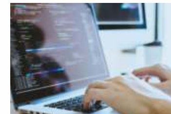
IT & Telecom